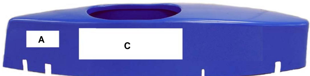
Photo # 13.1 Right Side View